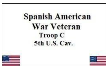
Photo typical of what was uploaded to FindaGrave for veterans of the Spanish American War buried with no military stone in McLean

Good news for you! I converted my photos to a digital copy of the book and it is now available to everyone on our website: tmcgs.org under RESOURCES—FREE. I tried to locate each person on Find a Grave. About half of the memorials did not acknowledge a person's service. For those who had no military monument, I created a photograph giving notice of their service, which war, which unit, and uploaded the photo to their FindaGrave memorial. On FindaGrave you can leave flowers, but those can be overwritten by others. Photographs will hopefully remain in the memorial as long as FindaGrave is in business.