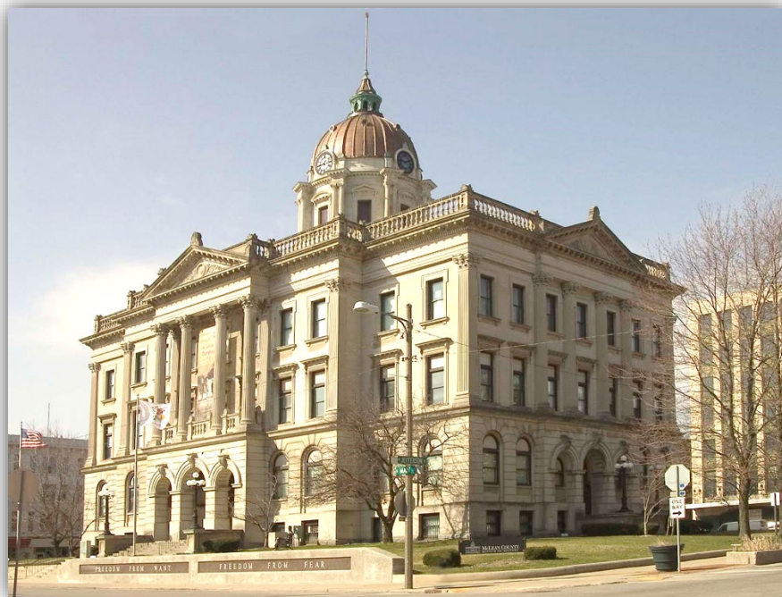
The McLean County Museum of History